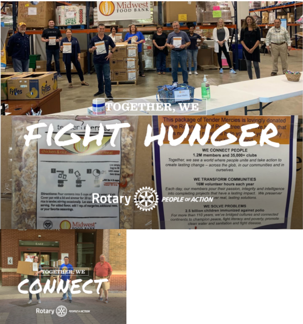
Posted by Mandy Timmons June 1, 2020