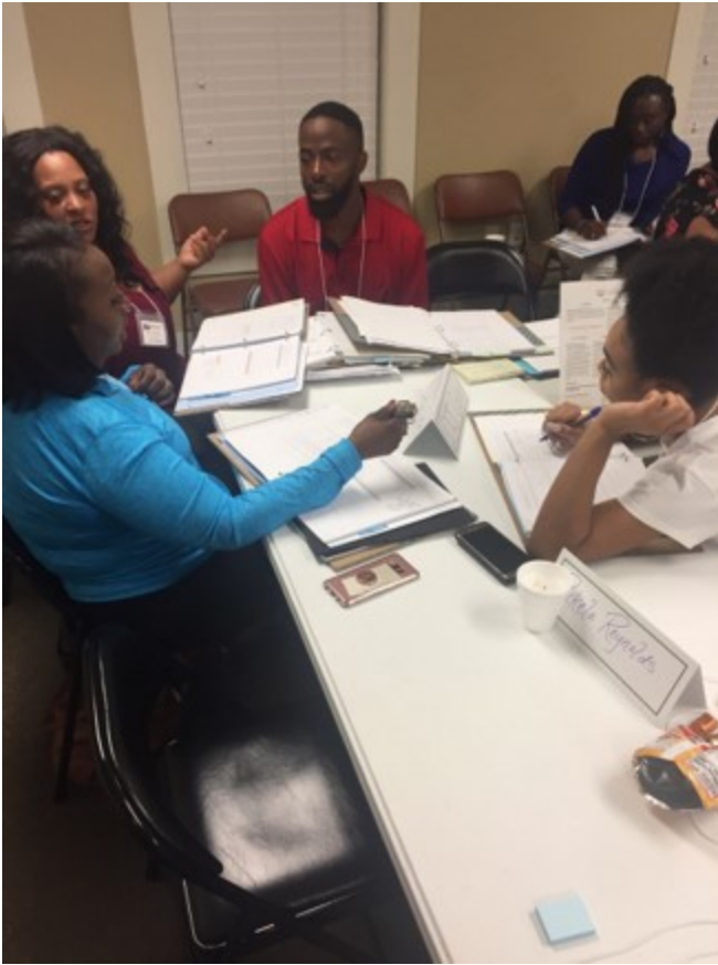
Posted by Carol Jones December 3, 2020