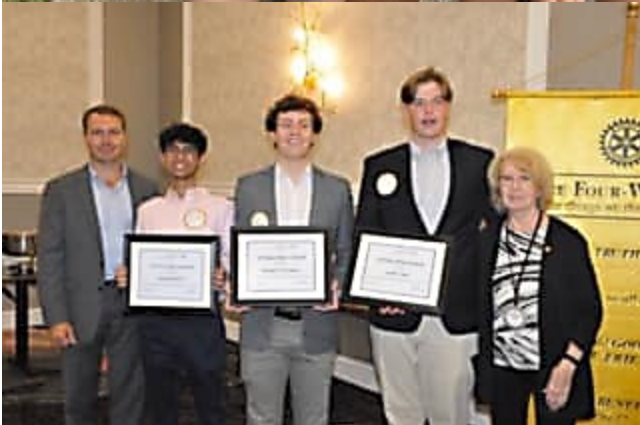
Posted by Sally Platt August 22, 2023