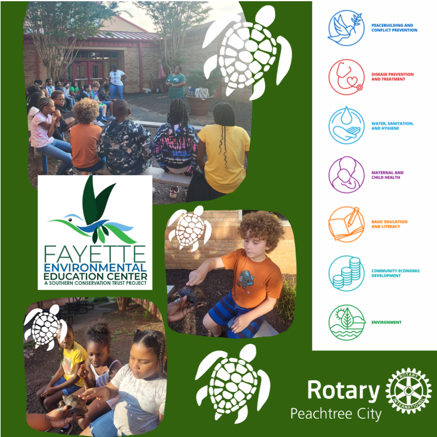
Posted by Holly Davanzo October 2, 2023