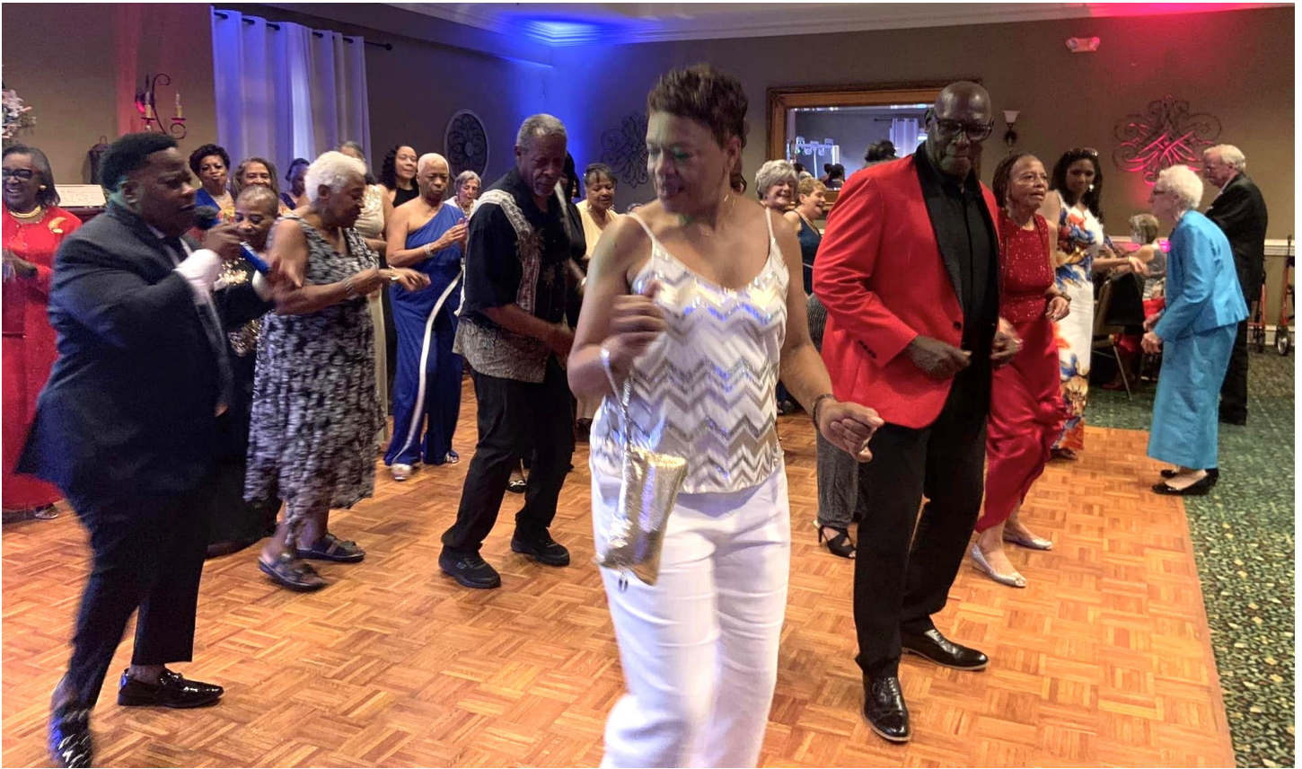
Posted by Vickie Butler October 2, 2023