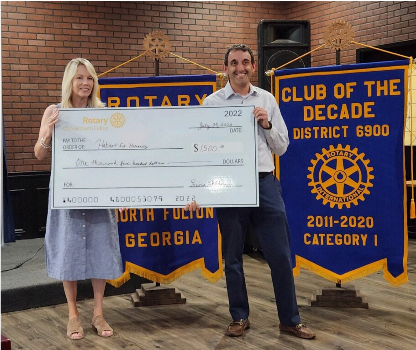
Posted by Lisa Gelber October 1, 2023