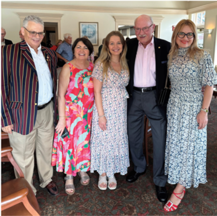
Posted by Julie Bond October 1, 2023