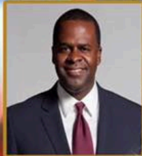
Atlanta Mayor Kasim Reed