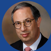
Carlos del Rio