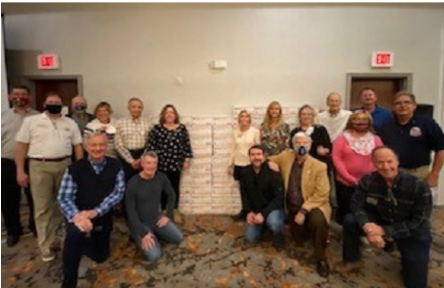
Posted by Trummie Patrick January 10, 2021