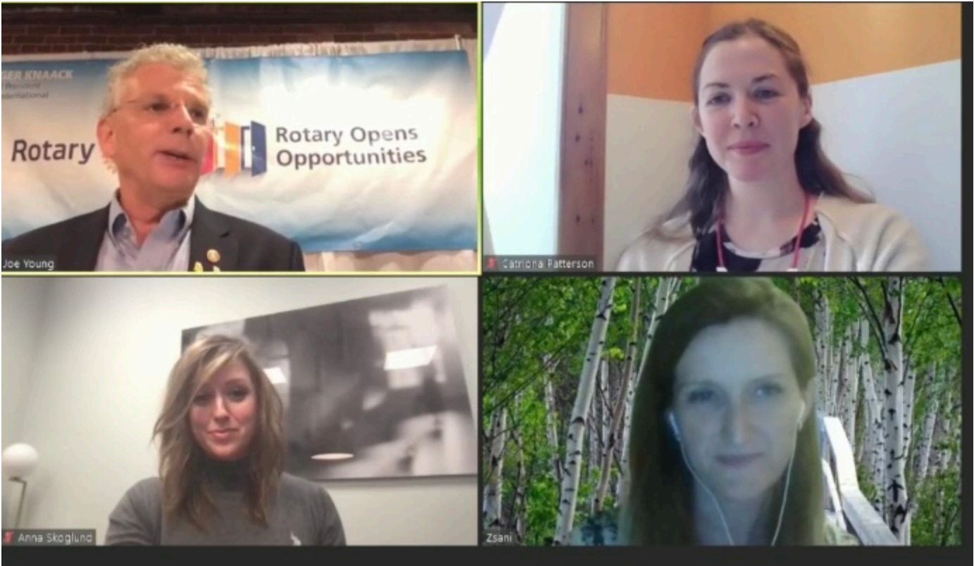
Posted by Ian Bond June 3, 2021