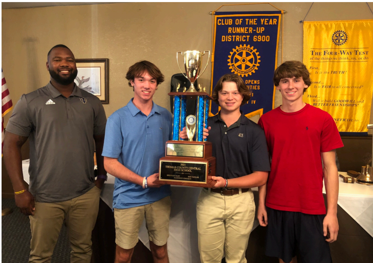
Posted by Adrian Burns December 4, 2021