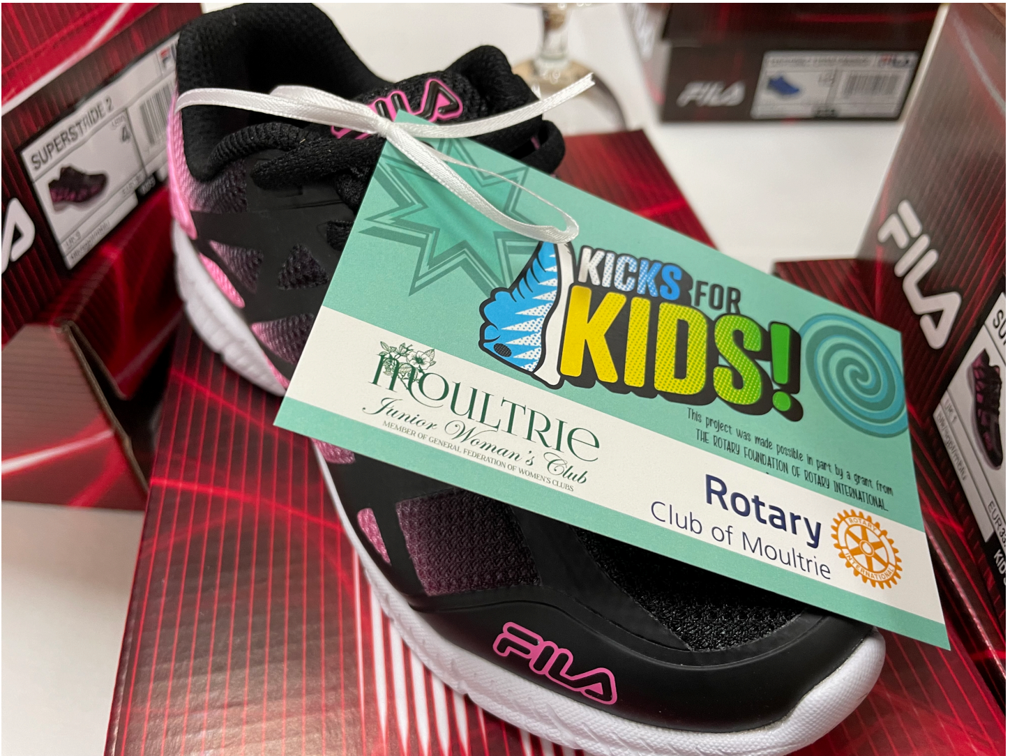
Posted by Jaclyn Donovan December 4, 2021