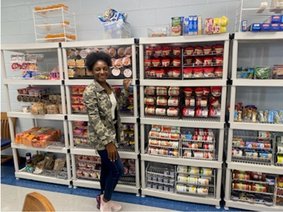
Posted by Laurie Lewis December 3, 2021