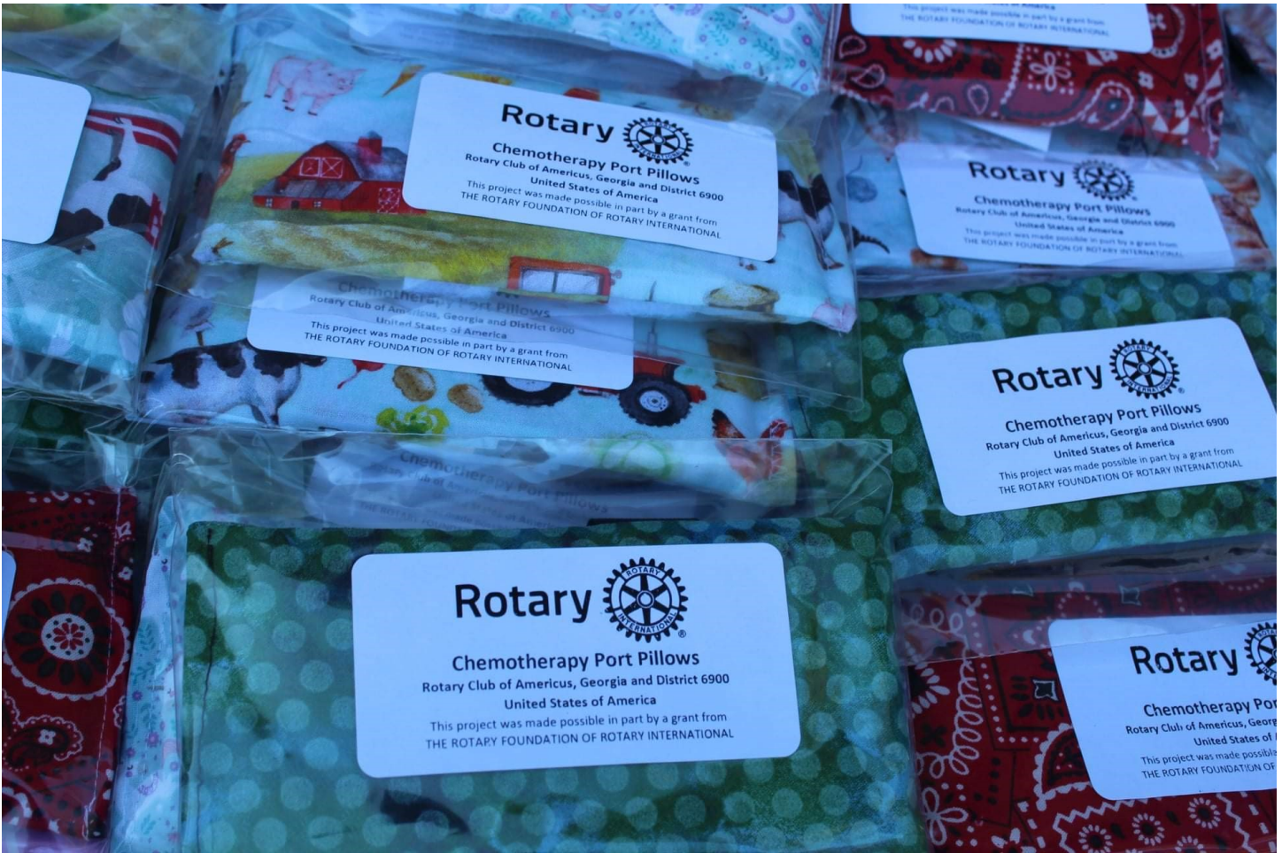
Posted by Angela Smith December 4, 2021