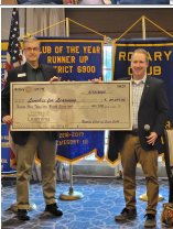
Area 17 Rotarian's Leadership for Excellence