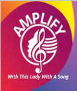
Area 17 Amplify Rotarians at 2023 District Conference - Registration Open

We are pleased to announce the 2023-2024 Community & Collaborative Community Grant Search. This is an excellent opportunity for organizations to receive funding for their projects.