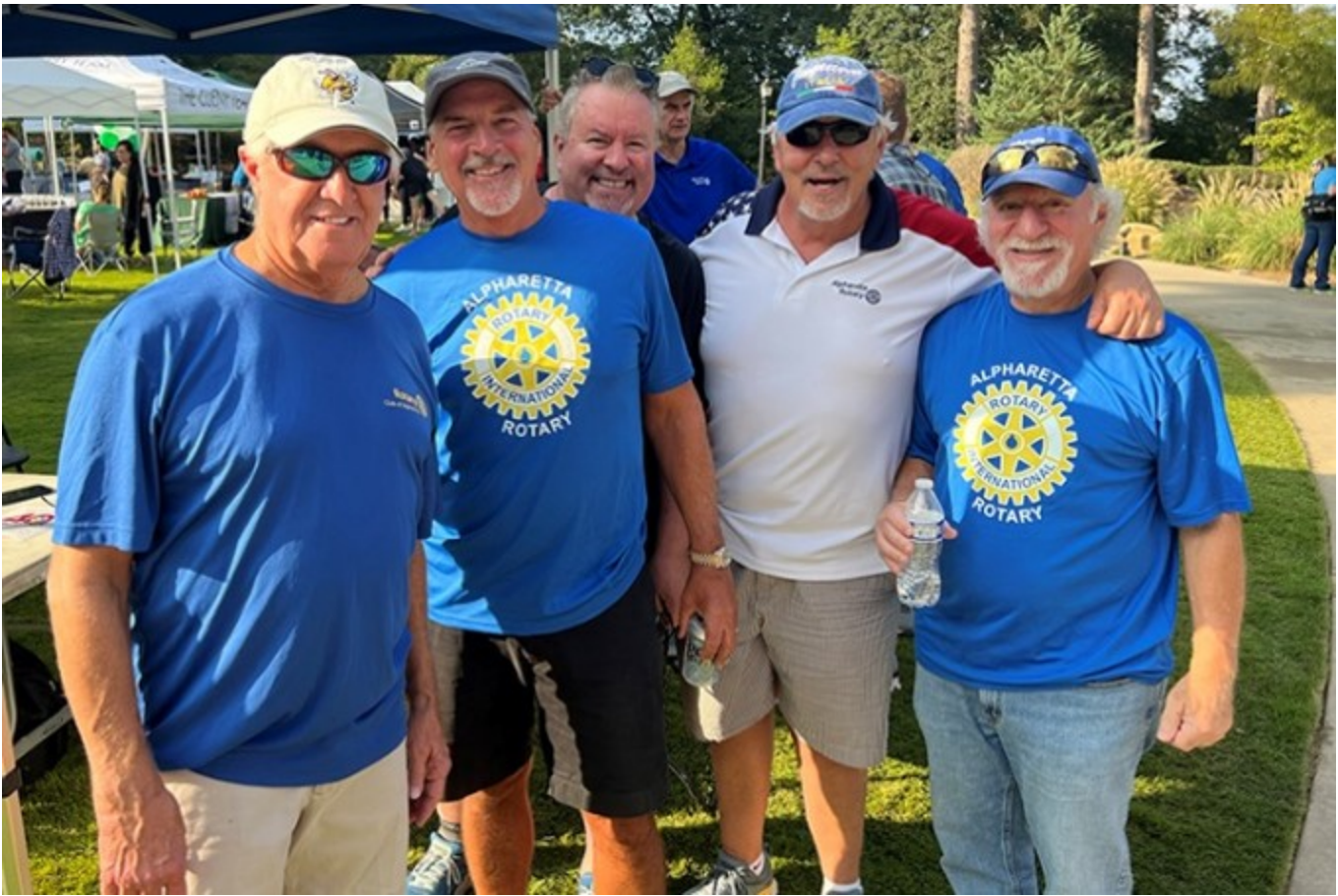
Posted by Clark Savage October 30, 2023