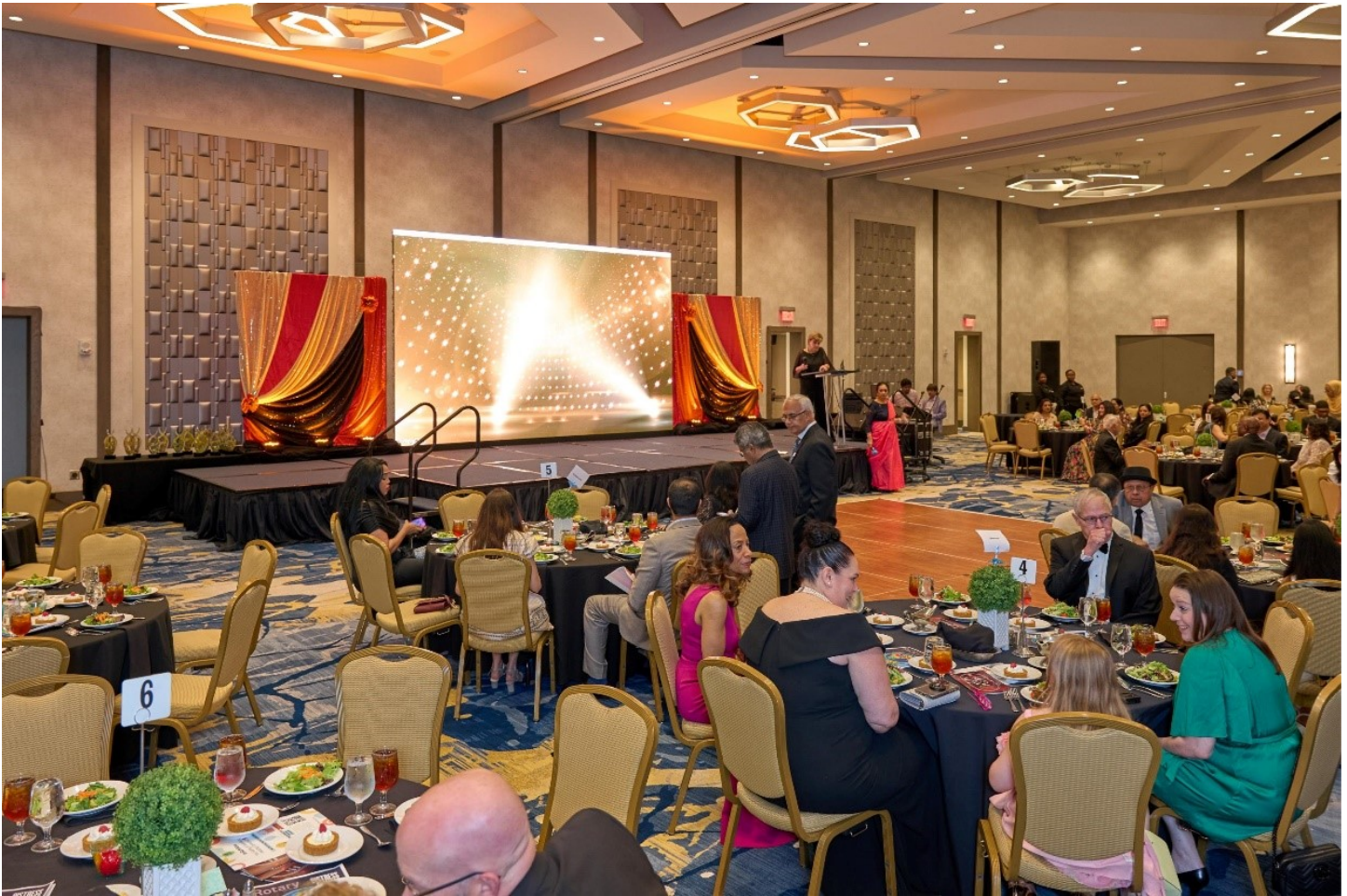
Posted by Syd Padala May 5, 2024