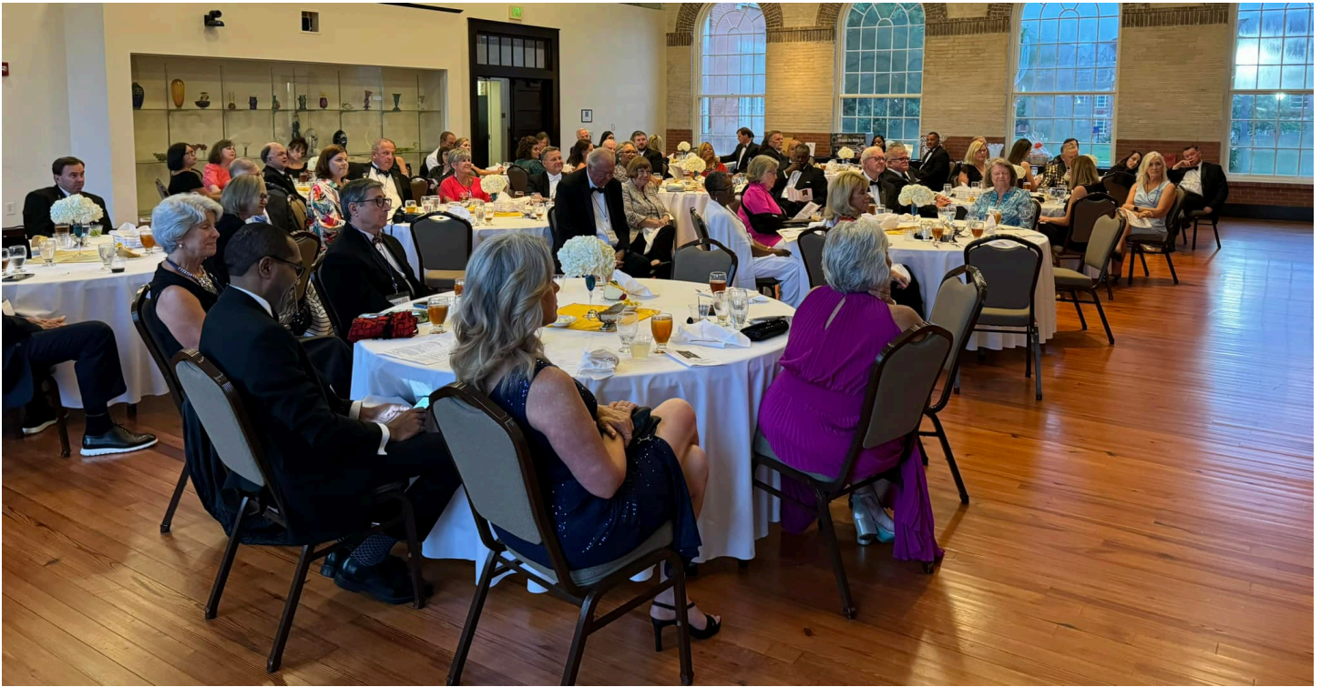
Posted by Angela Smith September 2, 2024