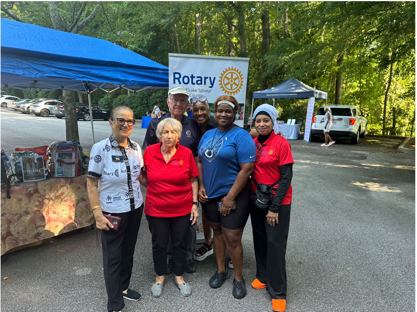
Posted by Gerrian Hawes July 24, 2024