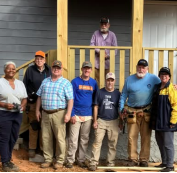
Posted by Janice Wallace January 3, 2025