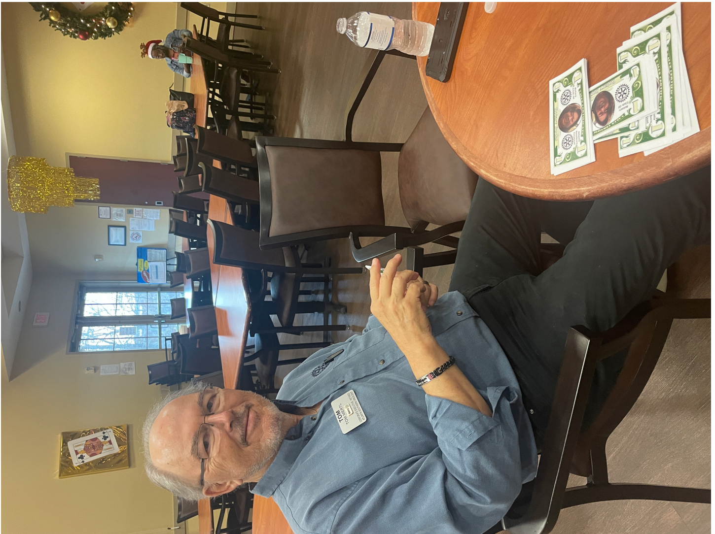
Posted by Claudia Mertl January 3, 2025