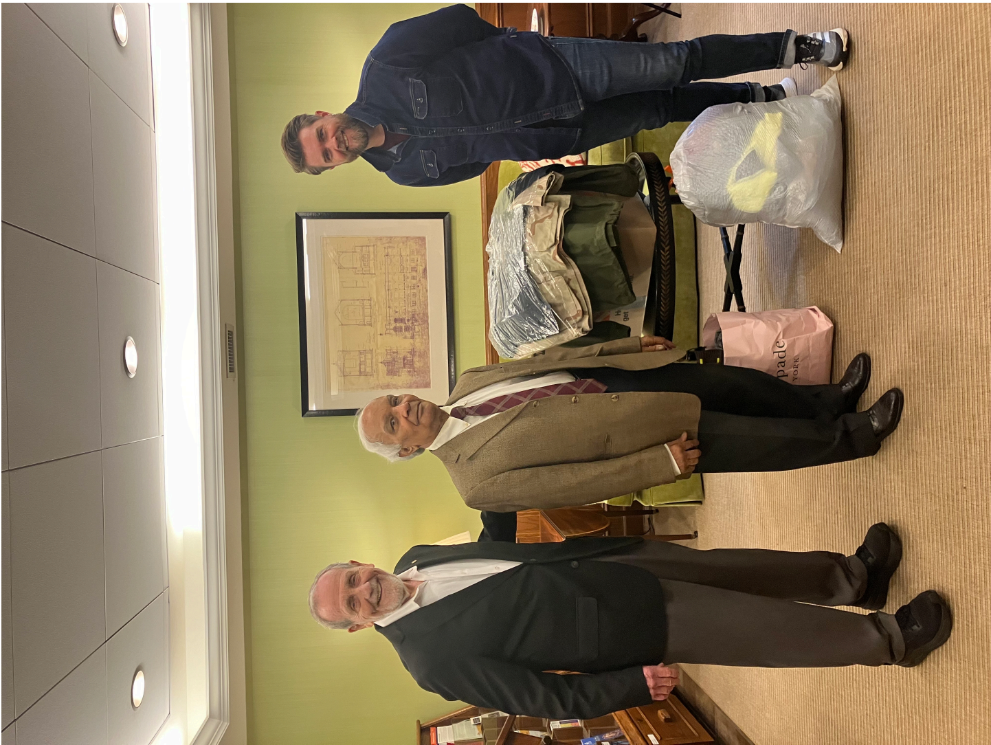
Posted by Angeli Abrol Duggal January 3, 2025