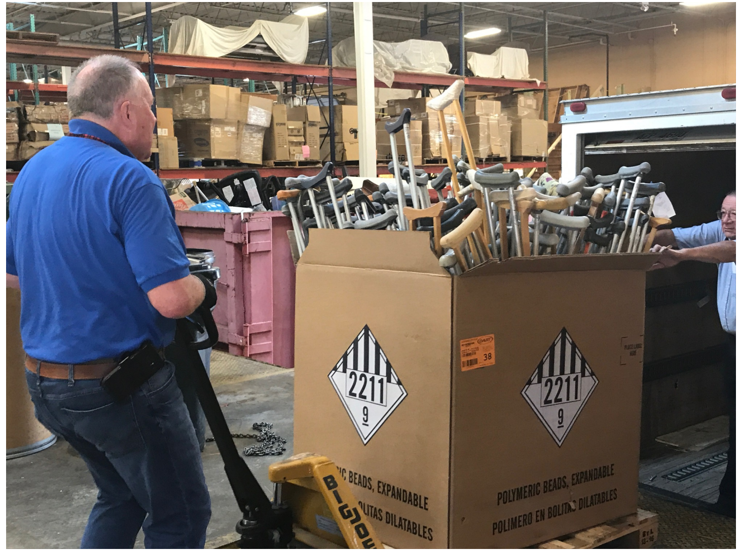
Posted by Rusty Warner, Jr. August 5, 2017