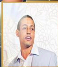
Tampa Bay Bucs Brent Grimes