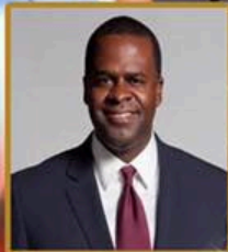
Atlanta Mayor Kasim Reed