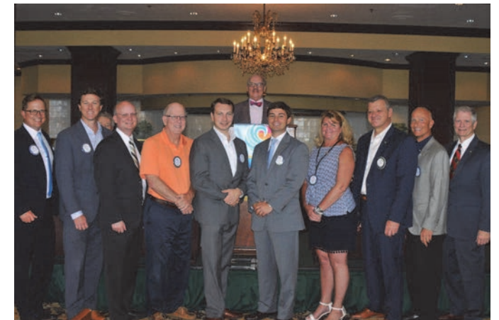
2019-20 Officers Rotary Club of Marietta Metro