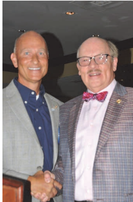
The Torch is Passed!