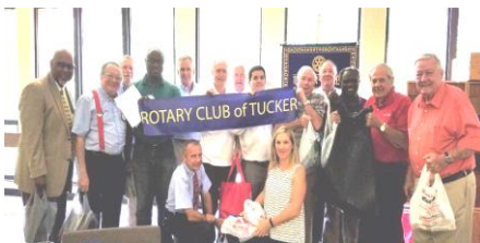
The Rotary Club of Tucker Contributes School Supplies