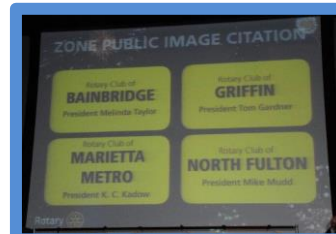
Griffin Rotary recognized with Zone 34 Public Image Citation.